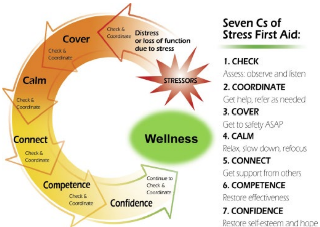
Figure 2: The Stress First Aid Model's Core Actions

Stress First Aid is based on a set of five evidence-based elements that have been linked to better functioning after stress and adversity in a number of settings. These elements are: (1) regaining a sense of safety, or cover , (2) restoring calm , to reduce intense physiological arousal and negative emotions, (3) feeling connected to sources of social support, (4) increasing the sense of efficacy, which means feeling competent to handle the situations that create stress (on one's own or as a team) or one's own reactions to the stress, and (5) experiencing hope or confidence in one's self and the world.